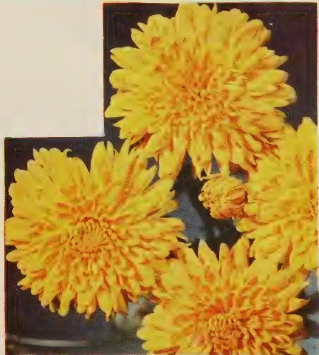
COMPANION. 75c each; 3 for $2.00

Dozen MUM COLLECTION A grand assortment of all colors, types and blooming seasons. Twelve Sure-to-Bloom Plants including 1 Evelyn Devaney, the glorious new shell-pink. (See front cover.) 12 Plants for $5.00